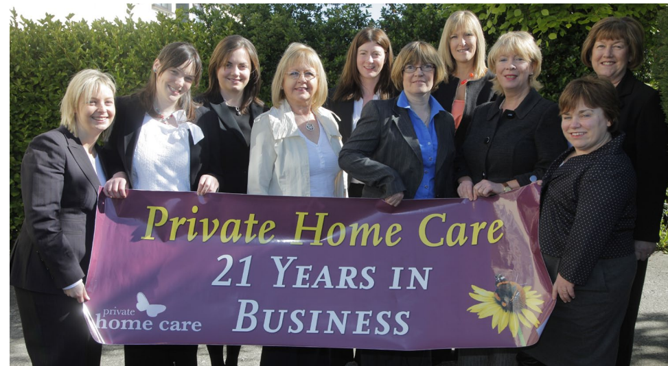
Pictured above are Private Home Care's office staff celebrating 21 years in business this year!

"I'm at work all day and worry that mum will forget to take her medication"