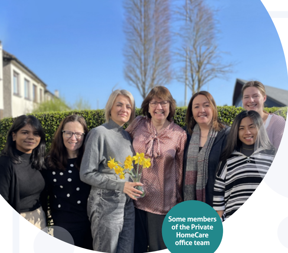
Some members of the Private HomeCare office team