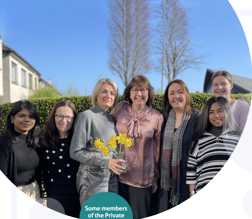
Some members of the Private HomeCare office team

Learn more about our home care services here: